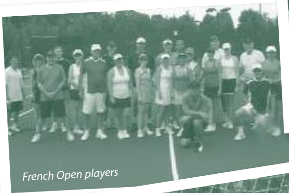
French Open players