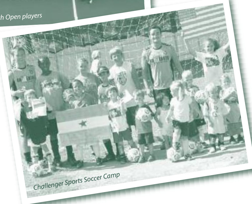
Challenger Sports Soccer Camp