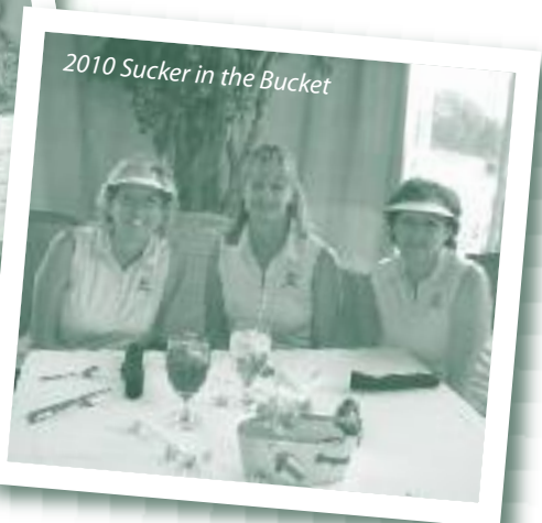
2010 Sucker in the Bucket