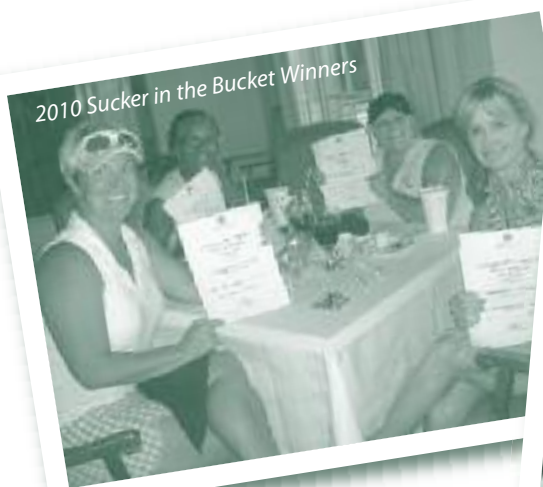
2010 Sucker in the Bucket Winners