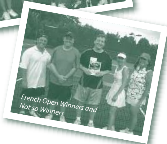
French Open Winners and Not so Winners