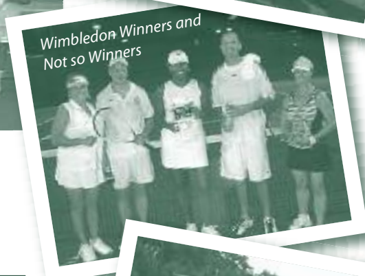
Wimbledon Winners and Not so Winners